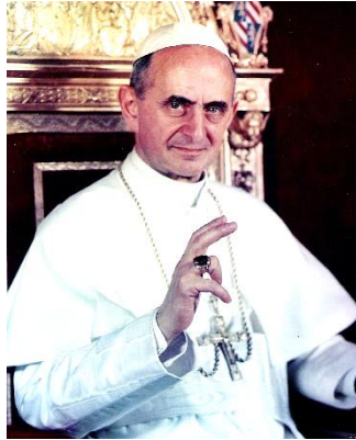
Pope St Paul VI

Today Pope Francis will canonise six people – in other words, declare them to be saints. This expresses the Church's firm belief that they are in heaven, and so we ask their intercession and follow their example. Among those being canonised are Pope Paul VI, who led the Church from 1963