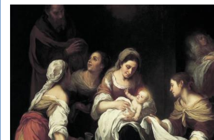
The Nativity of John the Baptist

MORE HELP NEEDED To serve refreshments and on the cake stall.